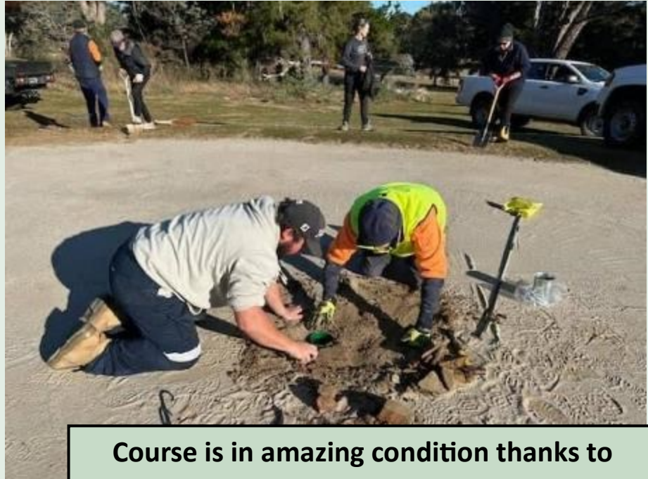
Course is in amazing condition thanks to Graeme and the volunteers