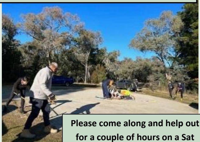
Please come along and help out for a couple of hours on a Sat morning -generally monthly Trish will notify date time etc.